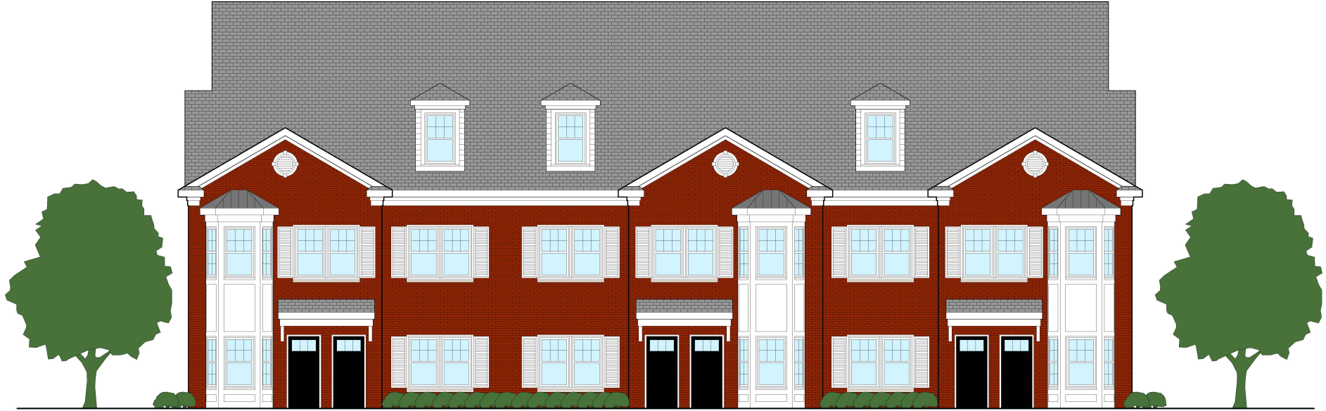
1 NORTH ELEVATION EX201 SCALE: 1/4" = 1'-0"